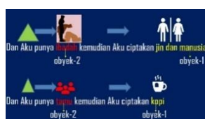
Figure 2. Negation Sentence Analogism

The words from not I created are identical between the sentence understudy or the first sentence with the analogy sentence or the second sentence. Object 1 in the first sentence, namely jinn, and humans, is replaced with coffee in the second sentence. The negation word except for between the 1st and 2nd sentences is identical or there is no change. Changes occur in object 2 in the first sentence, namely the word worship which changes to the word guest. All objects in the first and second sentences are categorized as nouns, although worship can be categorized as verbs. The urgency of equating all these objects into nouns aims to see the order of priority in the sentence.