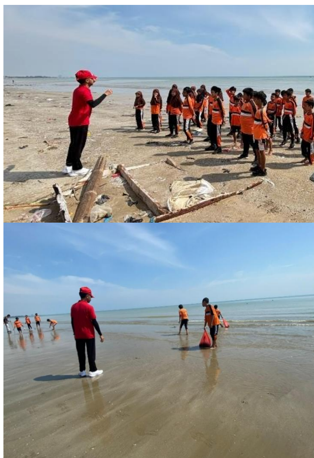
Figure 3. Implementation of the eco-PjBL model in Tuban coastal areas

In the next interview session, it was conveyed that teachers believed that the application of the eco-PjBL model was suitable for training students' independence and collaboration. In addition, this learning method was also suitable for fostering a sense of responsibility in students towards their living environment. The fifth-grade teacher also added that,